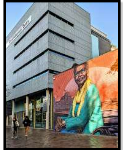
ULC, front entrance