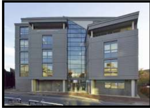
ULC, back entrance

The building used to be the Highbury City Centre campus (as seen in these pictures). Even though the building is now called University Learning Centre, the sign near the roof still reads 'City of Portsmouth Centre.'